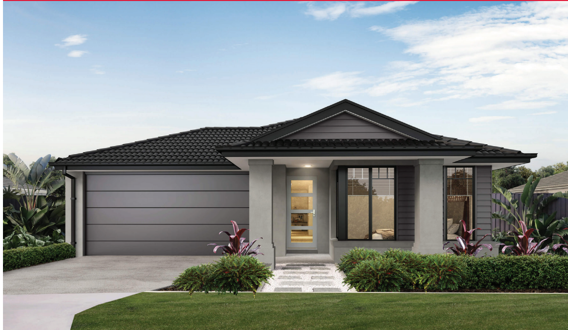
INGRAM 21_199 | METRO RANGE